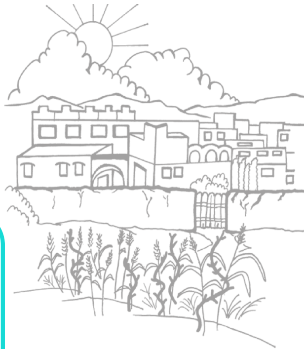
The Parable of the Weeds