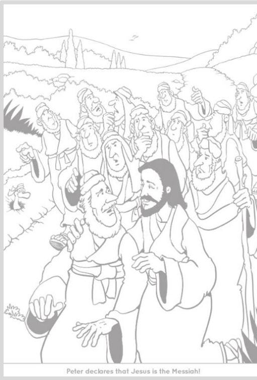
Peter declares that Jesus is the Messiah!

When Jesus came to the region of Caesarea Philippi, he asked his disciples, "Who do people say the Son of Man is?"